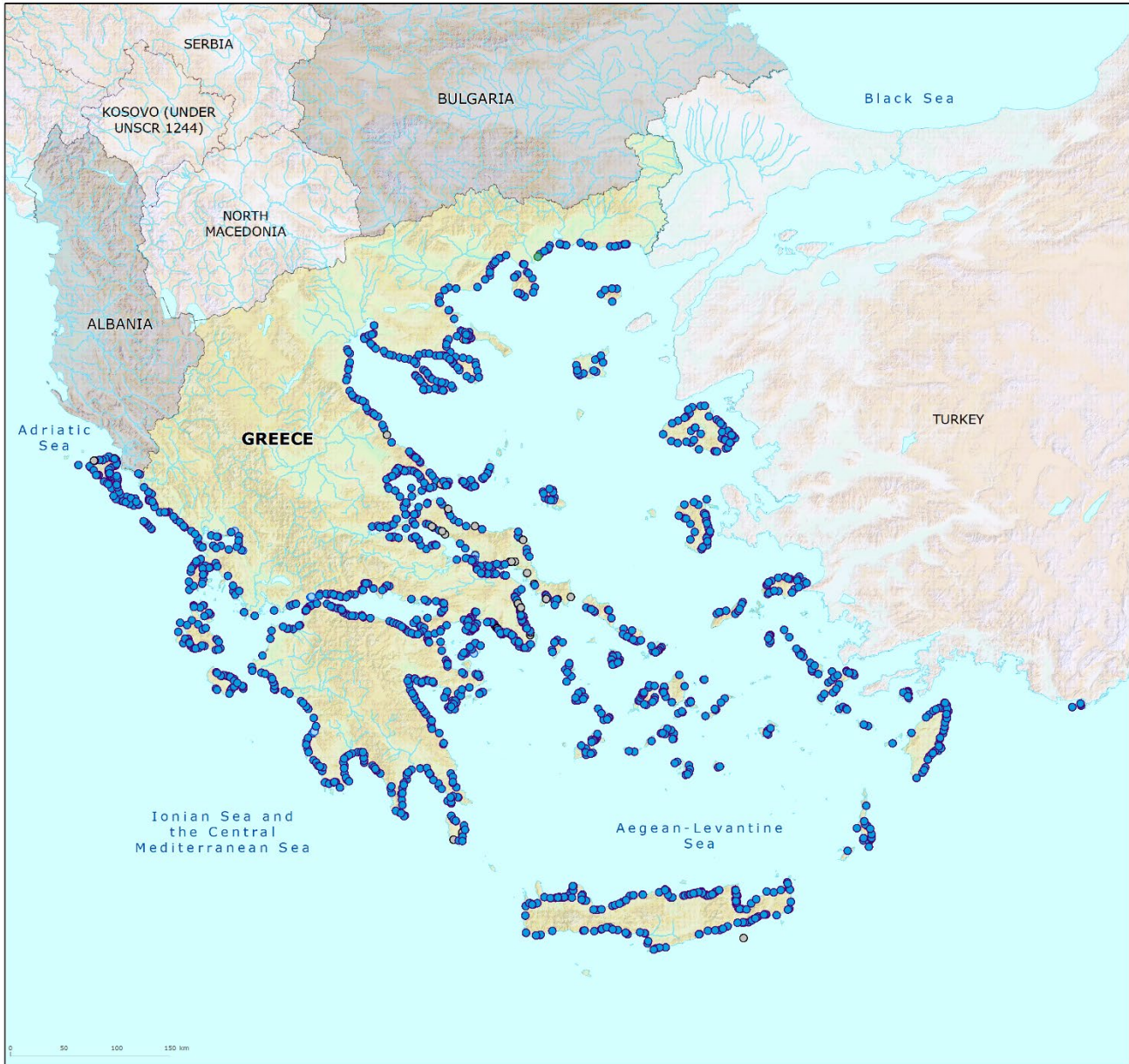
Map 1: Bathing waters reported during the 2024 bathing season in Greece